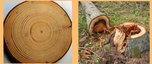
Fig. 1. Wood disc from spruce on former agricultural lands(30 years old) and root rot caused damage in spruce stands.

Heterobasidion infection was detected in 11 stands; from those we have chosen three stands with higher infection rate for analysis of genets of Heterobasidion root-rot infection and its spread among the trees. Preliminary results of Heterobasidion root-rot in two of those stands are presented here (Fig.3).