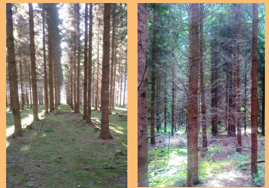
Fig. 2. Spruce stands on former agricultural lands.