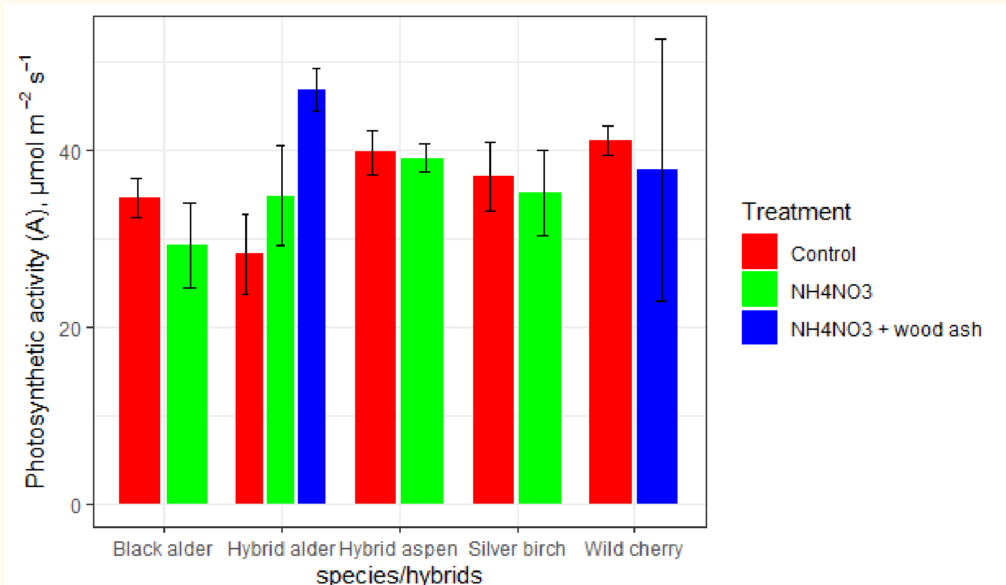
Figure 1. Photosynthetic activity of fast-growing deciduous tree species and hybrids at different fertilization regimens

4. No statistically significant correlations were found between leaf nitrogen, leaf carbon and soil parameters (total soil carbon, total soil nitrogen and pH); however, the correlations in most cases were weakly to moderately positive. The increased soil nitrogen content is reflected in increased foliar nitrogen levels, indicating that nitrogen in soil exists in forms available to plants.